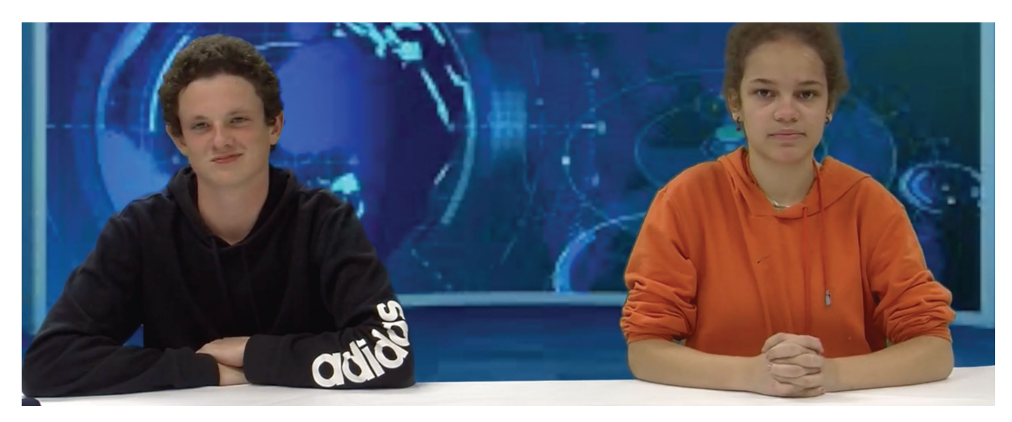
Figure 4. Students put themselves in the shoes of newscasters in the Starter Pack 'Green Screen Newscast.'

Intel SFI Starter Pack is designed to meet the evolving pedagogical needs of educators who are preparing learners for a future workforce. The program is available under license from Intel. For more information, please contact your Intel Technology Provider.