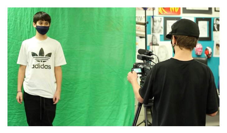
Figure 1. Students use green screen technology to record and edit their backdrops as they learn the fundamentals of live news production.

With its low student-to-teacher ratio, social-emotional curriculum, and passionate staff, OSP is well-organized to aid students who need more support and intervention than might be available at other schools in the Littleton district. When trailblazing OSP educators prepared to introduce Intel SFI Starter Pack activities to their classes, they set their students up for success. The educators carefully chose specific Starter Pack activities for their relevance to Colorado state standards, curriculum alignment, and technology accessibility. Then, supported by Starter Pack resources, they guided their students through the new experiences.